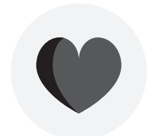
Mental health and well-being

The Kidney Hub also connects you with details on what to do during an emergency, (like hurricanes, fires, and floods). It has information on funding sources to support your ideas for education, advocacy, and helping others with kidney disease.