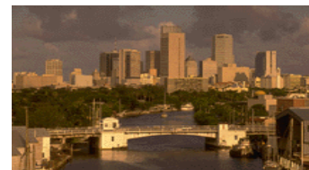
Patients may want to see a new city!

Creating a life plan takes personal reflection about goals and what a person wants to achieve. This is not an easy process, but it can be a fulfilling and rewarding journey. To help patients get started, staff may want to start with the sample questions below. Asking these questions helps remind patients of positive and successful situations in their lives. Recalling successful times can provide the self-motivation and empowerment needed to create goals and a plan to achieve them. 2